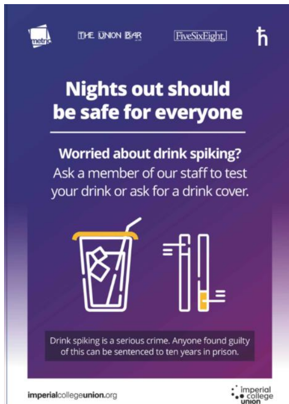
Amended on November 12. Currently in the process of being reprinted.